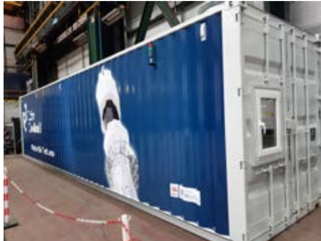
Dynacor test loop, Belgium