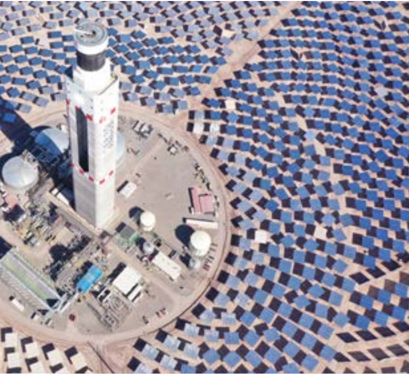
Cerro Dominador project, Chile

John Cockerill used his extensive and multi-century old expertise as a thermal and mechanical expert to master the many technical challenges that the solar receivers are facing while harvesting the intense solar energy flux.