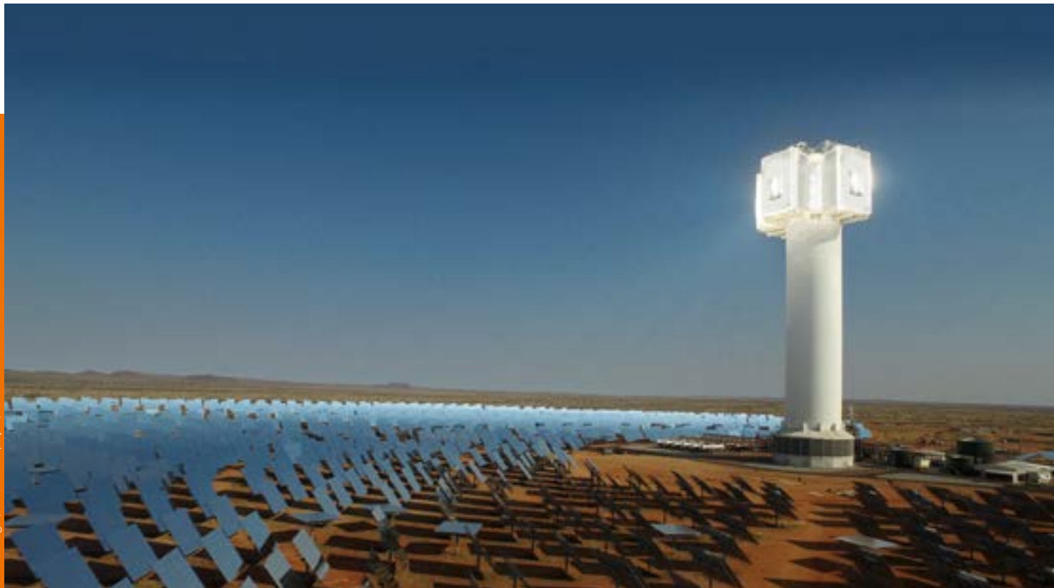
Khi Solar One project, South Africa

(*) IRENA (2020), Innovation Outlook: Thermal Energy Storage , International Renewable Energy Agency, Abu Dhabi.)