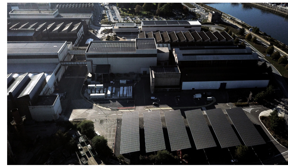
The roofs of the John Cockerill workshops are covered with 6,500 \mathrm{m}^2 of photovoltaic panels.